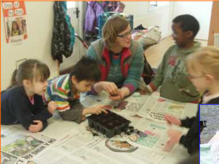
Junior and Senior Infants set potatoes and planted sunflower seeds that we saved from last year.