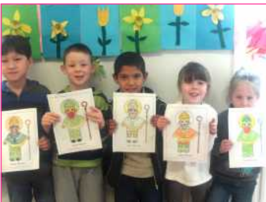
Learning about Naomh Padraig. The kids coloured these pictures to celebrate St. Patrick's Day, patron of Ireland.

Children in Junior and Senior Infants show their work around two traditional springtime festivities.