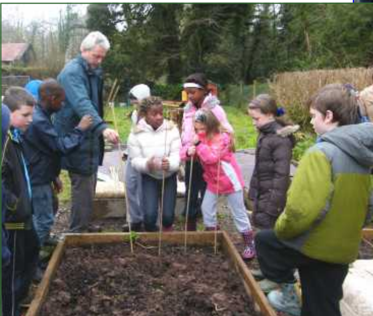
3rd and 4th set a variety of lettuce, peas and beans and made a wigwam and bamboo fence to support the peas and beans.