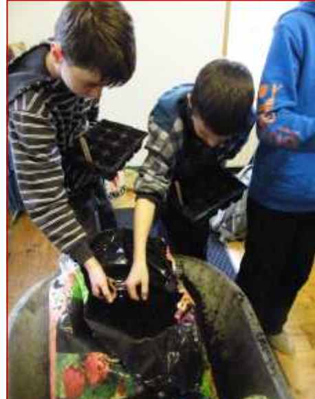
5th and 6th set carrot, beet-root, spinach, cabbage and rainbow chard.