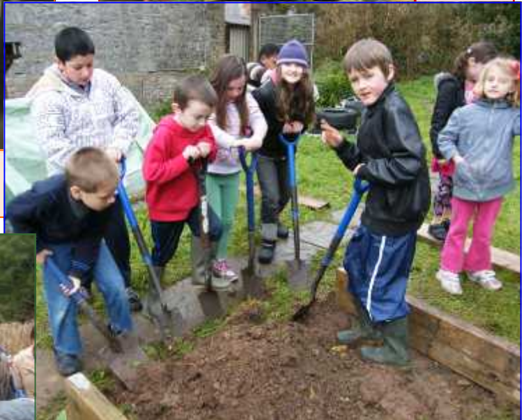
1st and 2nd Class made a new herb bed, arranged some natural seating and planted onion sets.