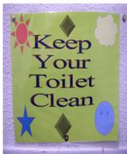
Signs for Toilets