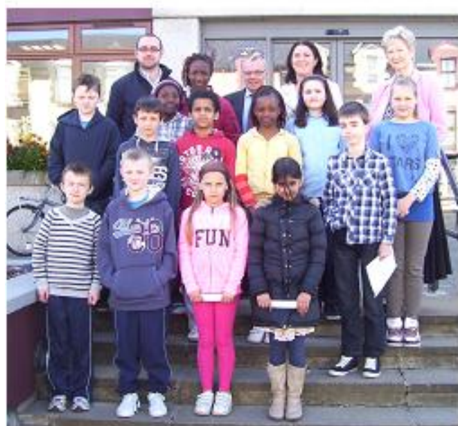
Trip to the Town Hall 27 th April 2012