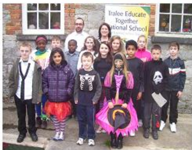
The Election - 28 October 2011

Training Session Friday 11 Nov 2011 2 to 5 p.m.