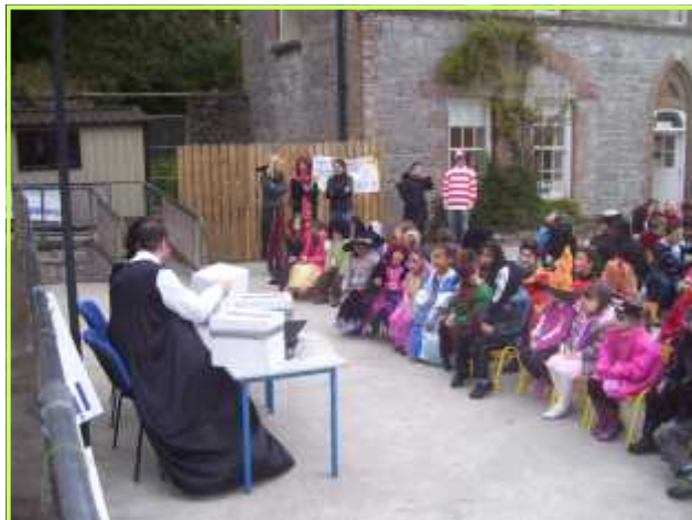
The counting of the votes for the Students Council in the school yard.