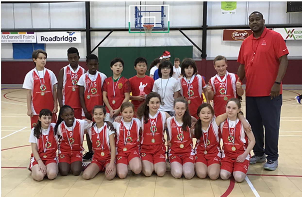
4 TH , 5 TH and 6 TH Class Basketballers played two friendly games against Moyderwell NS this week. They did us proud! Well done to all involved.