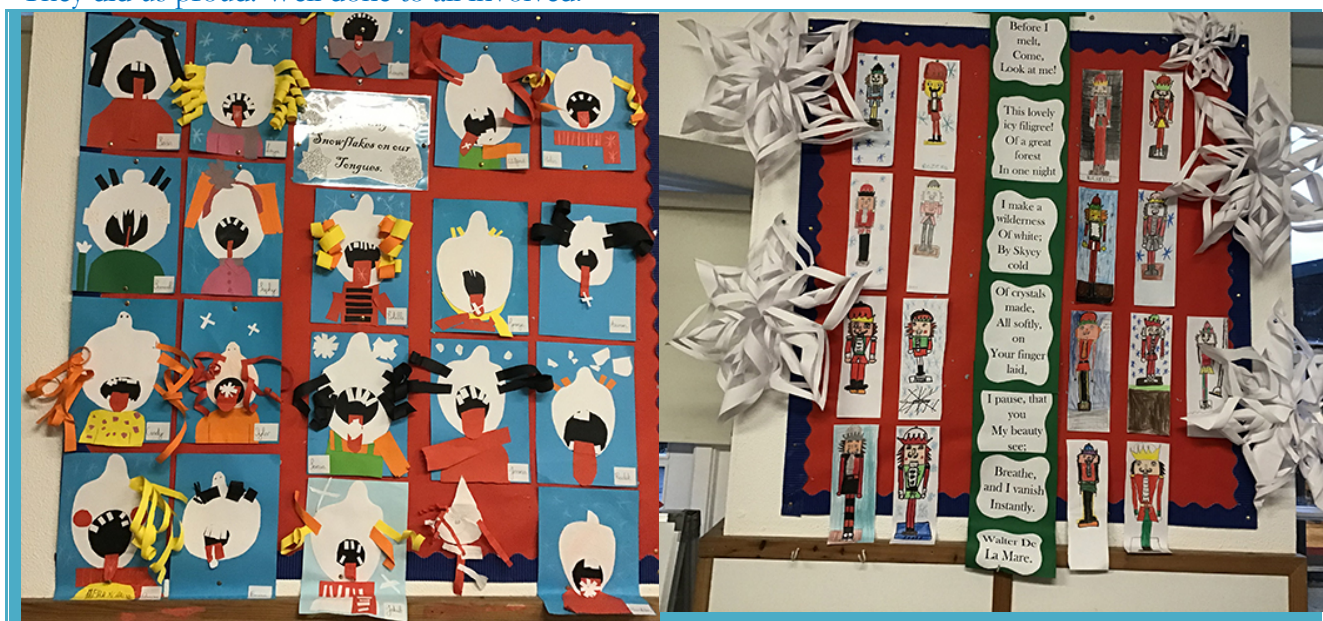
3 rd and 4 th Class Winter Artwork