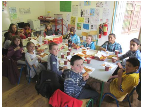
Training October 2012