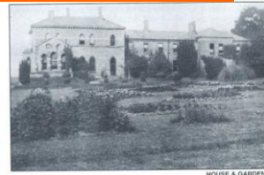
HOUSE & GARDEN

This is a short history about Collis Sandes House. It was known as Oak Park House until 1994. The Estate covered the land from the House all the way down to the Lodge on Killeen Road.