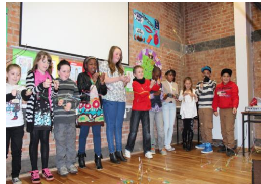
Anniversary Speech 9/12/12 We also did Open Day Speech on 20 th March 2013