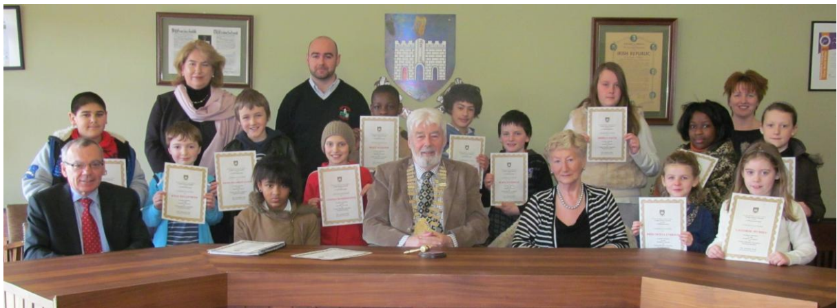
Trip to the Town Hall February 2013